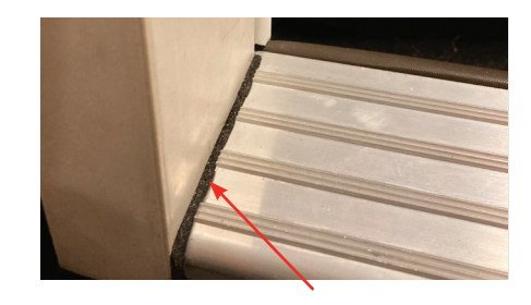
OPTIONAL JAMB AND THRESHOLD SEALS