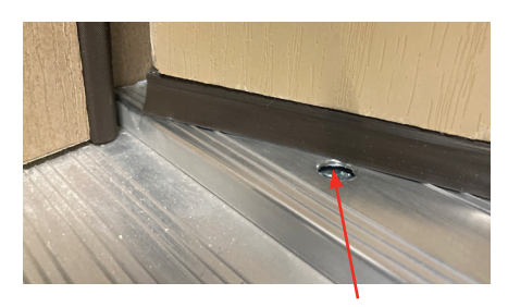
ADJUSTABLE SCREWS (WEATHER SEAL IS HIDDEN FOR ISCS)