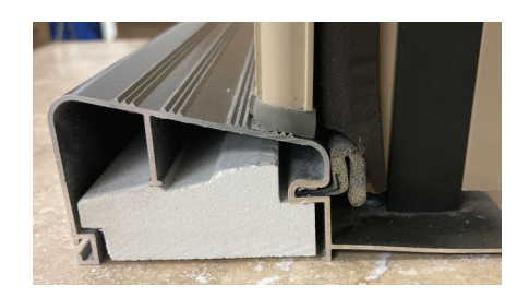
REVERSE HIGH DAM PREVENTS WATER INFILTRATION