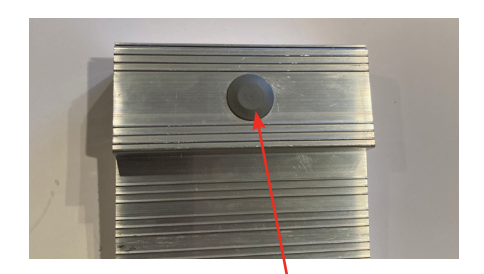
SCREW HOLE CAP