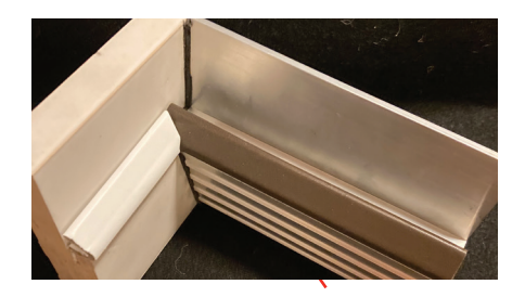
OPTIONAL JAMB SEALS