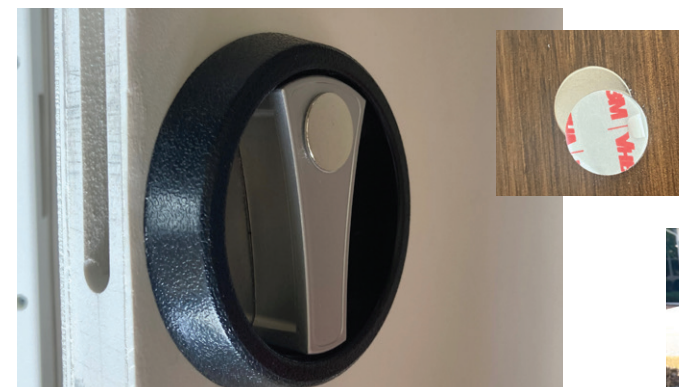
Hand turn lock with a hardened steel throw is simple and easy to operate.