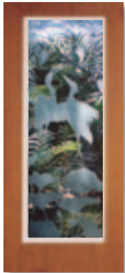
BHB JUMPING CRANES