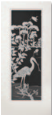
BH2B-M HERON IN THE CYPRESS