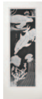
BH1U SEA LIFE