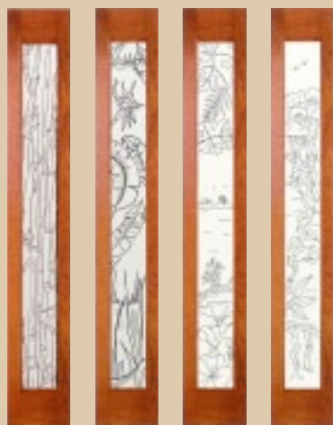
BH3FSL BH2SL1 BH2SL2 BH2BSL