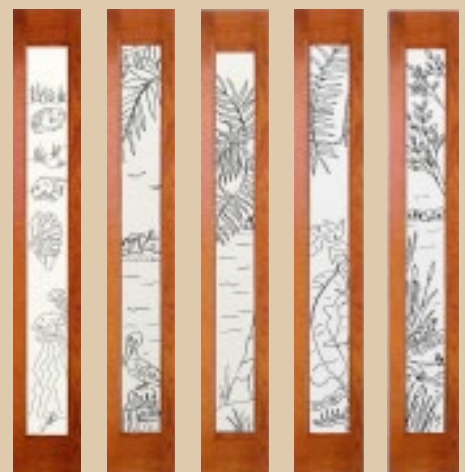
BH3USL BH4FSL1 BH4FSL2 BH4FSL3 BH1BSL