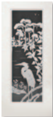
BH2B HERON IN THE CYPRESS